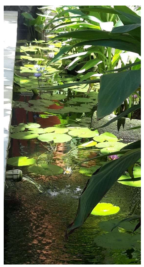
Fish and Plant Pond in Bali