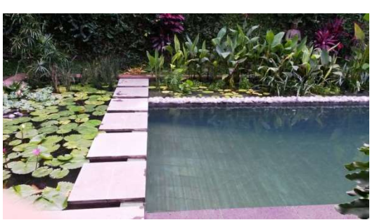
Reduces Maintenance Costs and Friendly to Human