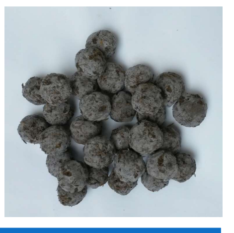
Probiotic Bacteria Tehnology