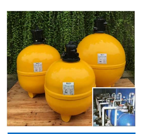
Bayern Sand Filter