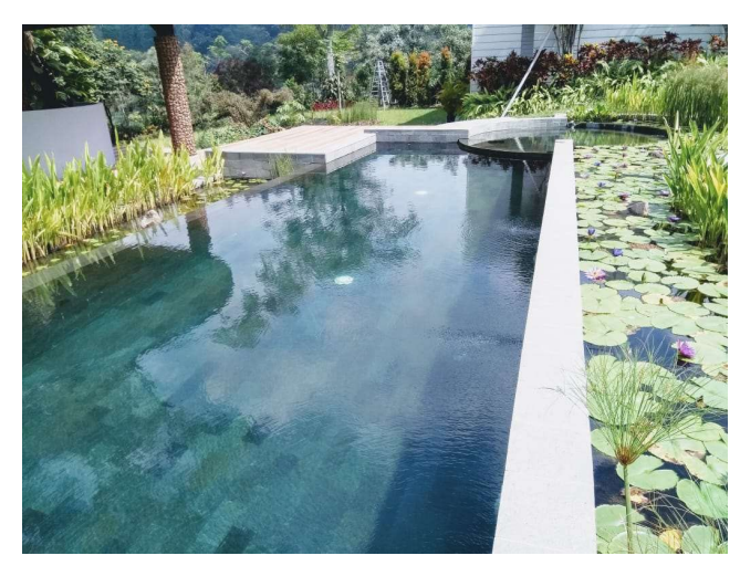
Natural Pool in Tretes, East Java