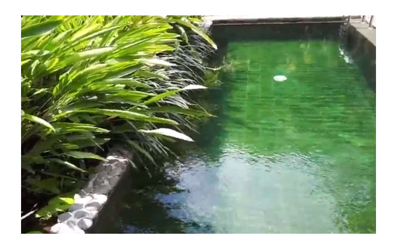
Fresh Water without Chemical